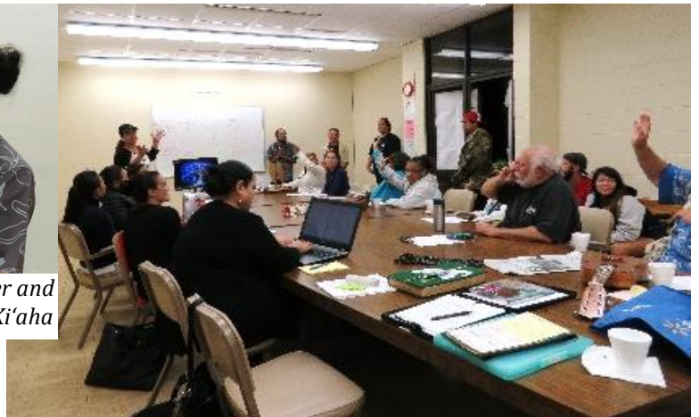
Hawaiian Civic Club of Wahiawā members enjoyed asking questions.

11.08.2k17 ...Following our regular monthly meeting, HCCW Board of Directors met for the last time for 2017.