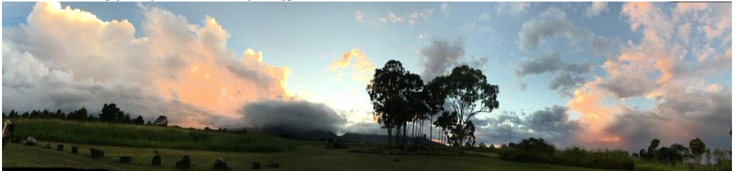
Skies opened up as the storm clouds cleared for our East-West Center haumāna’s afternoon visit. A beautiful hō‘ailona indeed...eō

Excerpt from our HCCW website Kukaniloko.org