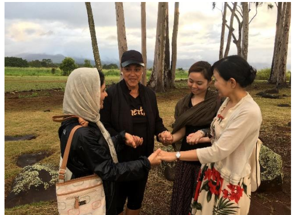
We are Aloha and it is as simple as the smile upon our face...