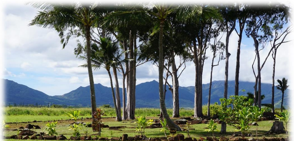
Ōlelo No'eau...Hawaiian Proverb #2273...MARY KAWENA PUKUI... Nani Ka'ala he ki'owai na ke kēhau...Beautiful Ka'ala, a pool that holds the dew.

***** The next HCCW monthly meeting will be held at the Wahiawā Police Department Meeting Room, located at 330 North Cane Street at 7 pm on the second Wednesday of the month, January 10 th , 2018 . See you there!